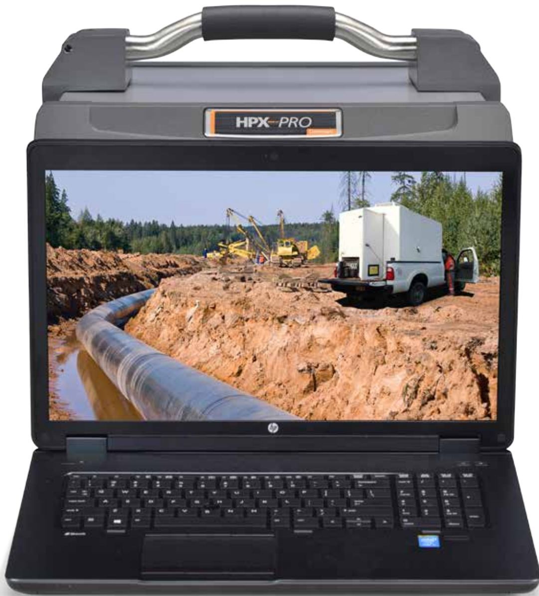
Product size to scale.

keep in pace with extreme process conditions like pipeline imaging. The new software tools also provide quick image analysis and customized reporting for generating unique customer reports in seconds. From hardware to software, to deep in the field and instant image sharing, the HPX-PRO is a complete system, designed to improve productivity.