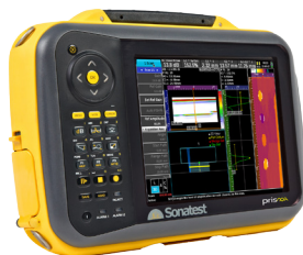
Prisma (IPA or 2TOFD)