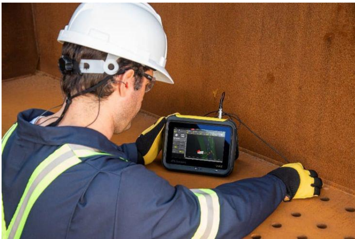
Figure 1 – AWS Inspection with the WAVE

The American Welding Society (AWS) codes are used in North America to inspect various types of welds in conventional ultrasonic testing (UT). The type of welded material, the welding process and the industry directly influence the inspection criteria. The Sonatest WAVE instrument with its Interactive Scan- Plan can significantly optimise the visualisation of the weld joints since the A-Scan signal is displayed along the sound path, allowing a comprehensive identification of potential defect locations. WAVE Companion, a PC software managing tool, allows the creation of dedicated applications (Wave App) that contain relevant parameters in compliance to AWS guidelines and other inspection requirements.