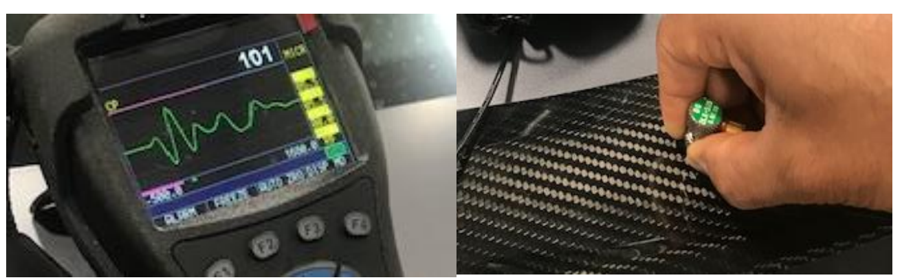
Figure 2 – coating thickness measurement on composite substrate

For further information or support, please contact the Sonatest Applications Team: applications@sonatest.com