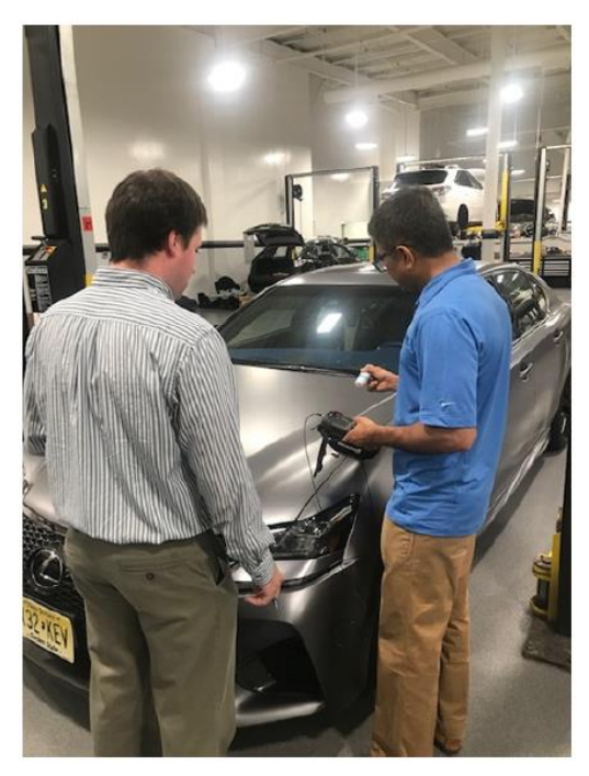
Figure 2 – Paint inspection on metal

©Sonatest 2023. All Rights Reserved. All the information here is subject to change without prior notification. Page 1