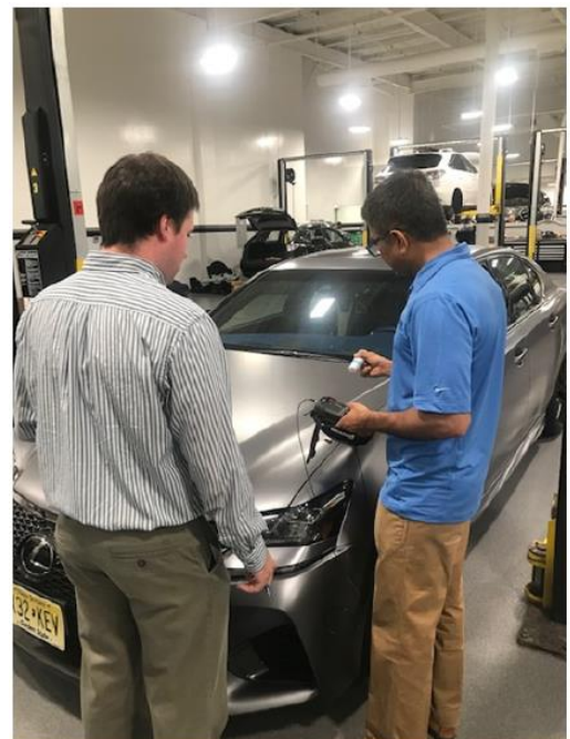
Figure 2 – Paint inspection on metal