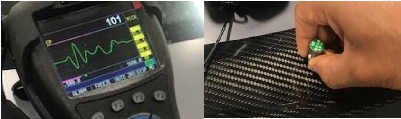
Figure 2 – coating thickness measurement on composite substrate

For further information or support, please contact the Sonatest Applications Team: applications@sonatest.com